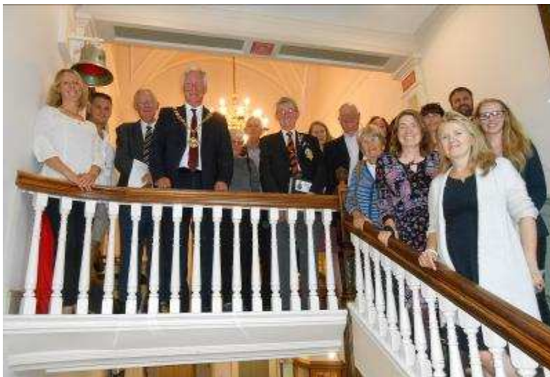
Discretionary Grant Recipients with the Mayor of Chichester

Chichester City Council changed their policy on presenting Discretionary Grants in 2018/2019 whereby all Grants were to be paid by BACS payments.