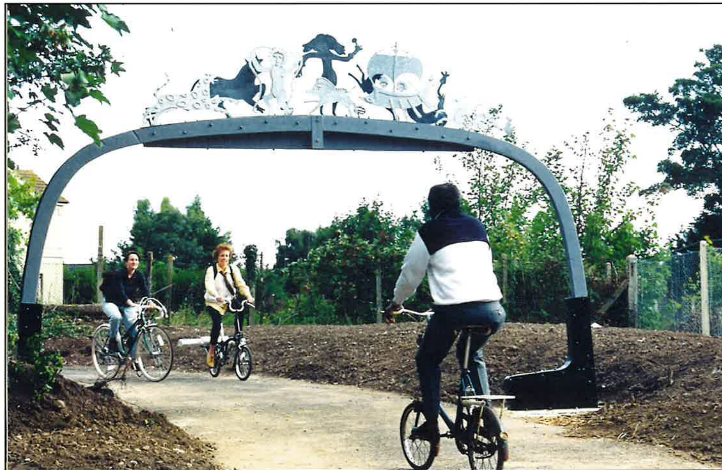
The Gateway Arch when newly installed in 1995.