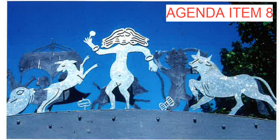
A close-up of the many characters made from galvanised steel plate.

Friends of Centurion Way (FOCW) are a local group of residents who volunteer their time to preserve and protect this remarkable public way. This year we are leading a fundraising campaign to repair and reinstate the Archway. Applications